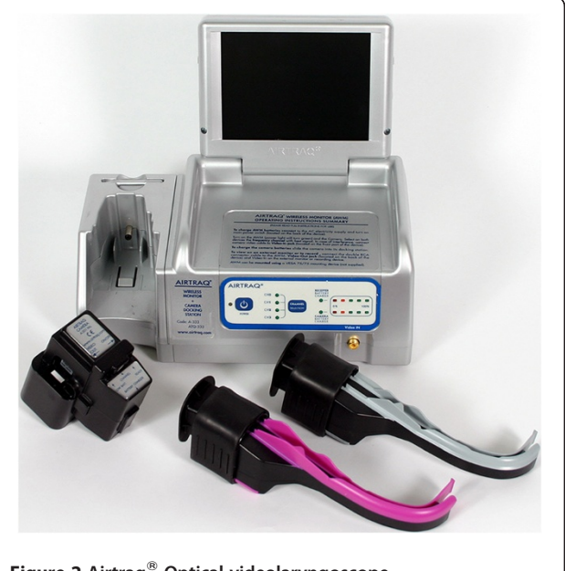
Figure 2 Airtraq<sup>®</sup> Optical videolaryngoscope.

breathing difficulties during sleep or a dysmorphic feature with apparent micro- or retrognathia.